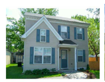
Laurence Harbor 3 Beds & 2.5 baths