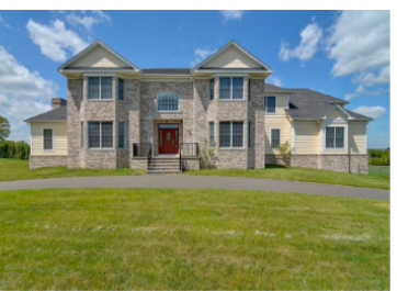
Colts Neck 5 beds & 5.5 baths